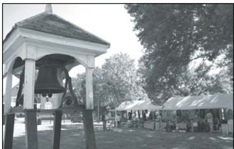
Chautauqua Days in Millersburg Millersburg celebrated its annual Chautauqua festival in the city park from Sept. 17 - 19. Most people we spoke with felt the baby contest was the best part of the event.