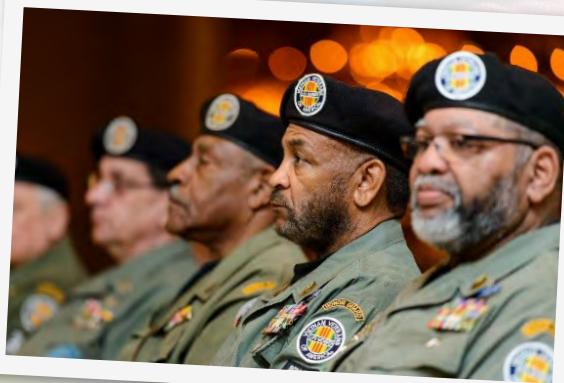
Hospice Welcome Home Event, Hospice of the Chesapeake